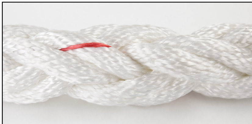
Color: White with Red Tracer