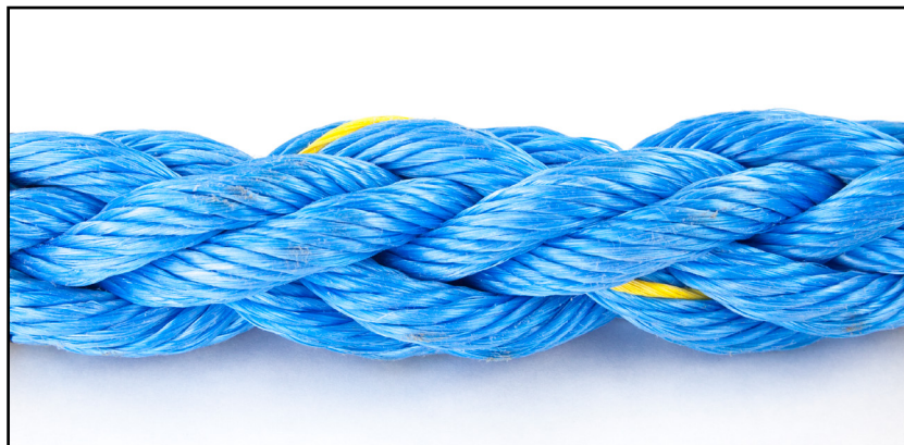
Color: Blue with Yellow Tracer