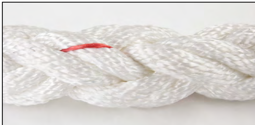
Color: White with Red Tracer