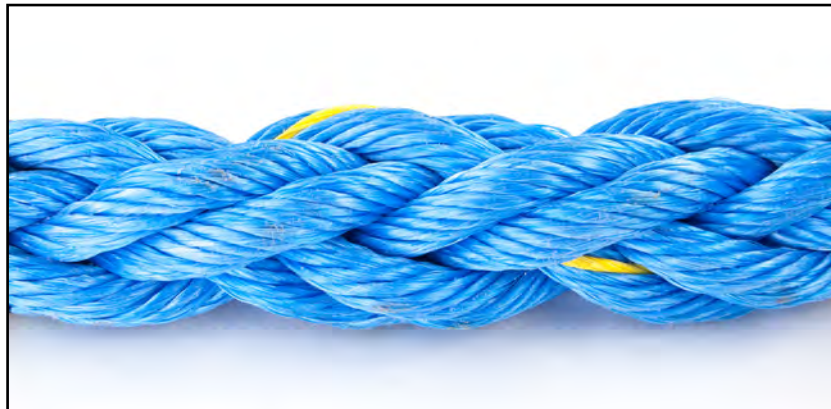
Color: Blue with Yellow Tracer